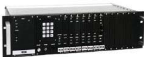
ACU-1000 Intelligent Interconnect

This multiple radio installation is useful in the local area, but is not feasible State-wide. The number of different radio systems is simply too large. Further, addition of more than two or three radio systems becomes extremely cumbersome – and sometimes dangerous through distraction or missing information - to the radio users/First Responders.